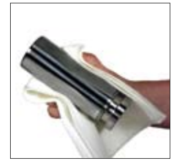
1. Lightly polish the rod surface with an emery cloth (600 grit). Inspect the finish of the rod for any scratches or gouges. If the rod is damaged it must be replaced. The rod safety ring may remain in place.