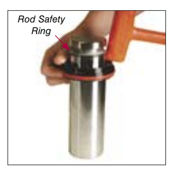
4. Tap the cushion collar down to slide off the rod end and discard.