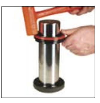
2. Using some of the assembly oil lubricate the rod and slowly tap the new cushion collar onto the rod assembly from the top of the rod. Using a mallet or an Arbor Press, seat the collar against the rod retainers.