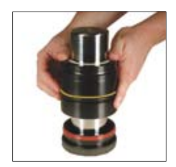
5. Position the cartridge assembly over the rod, making sure the wiper end marked "TOP" is facing up. Slide the cartridge down the rod to the cushion collar. Be careful not to force the cartridge at an angle as the seal could become damaged.