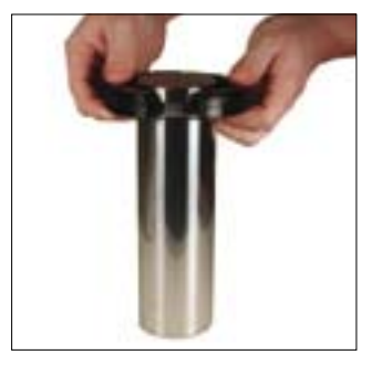
1. Replace the retainer halves and add the wear ring.