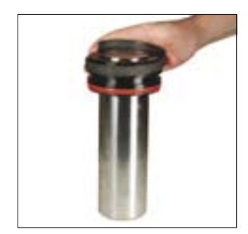
1. Remove the wear ring.

IV.a. Piston Rod Disassembly Continued from DADCO's Large Gas Spring Maintenance Instructions —