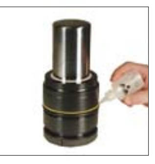
6. Extra oil should be applied to the housing o-ring, cushion seal and the inside of the housing.